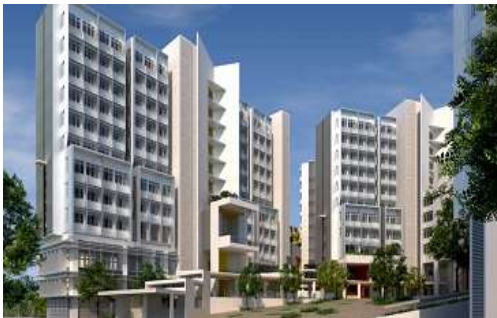
NTU Hall of Residence