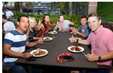
Make friends from all over the world

Ranked among the top 1% of universities worldwide, NTU places you in an academically stimulating environment that is both culturally and socially enriching. Our comprehensive and innovative approach towards education and research will help contribute to your future success and inspire you to realise your full potential as an entrepreneurial and technologically-savvy leader.