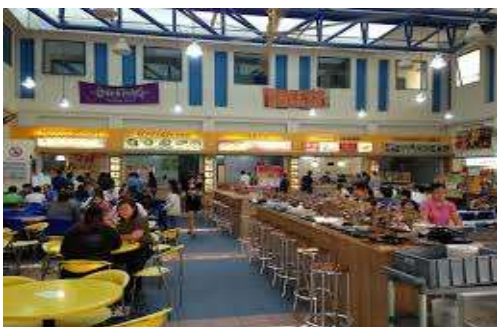
Hall of Residence Canteen