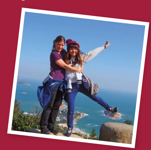
... and a few months later during a visit to Hong Kong

The Buddy Program aims at initiating an intercultural exchange between international and Tübingen students and will allow the IES students to get to know German student life first-hand and to make friends. Together you can spend your leisure time or take part in events offered by the IES Program.